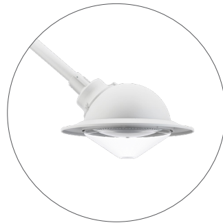
GC Light grey