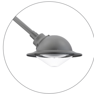
GO Dark grey