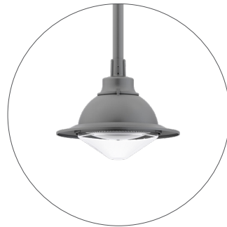
GO Dark grey