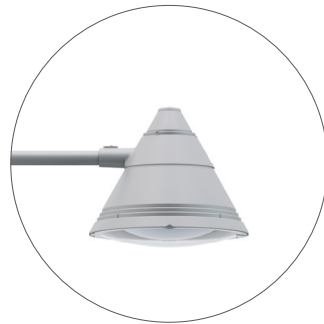
GC Light grey