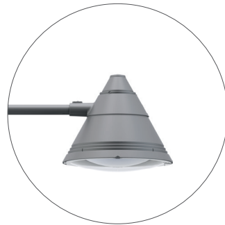
GO Dark grey