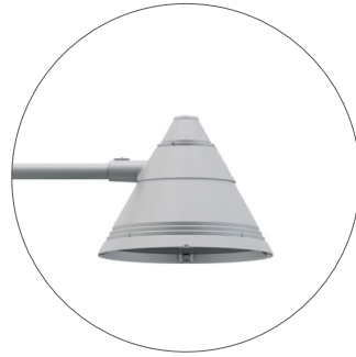
GC Light grey