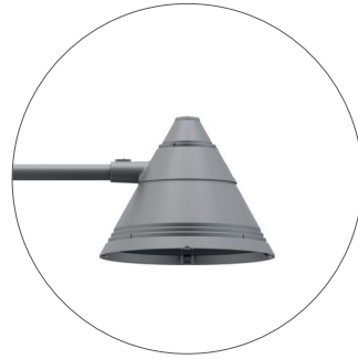
GO Dark grey