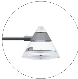
GO Dark grey