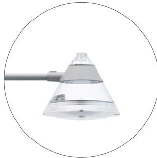
GC Light grey