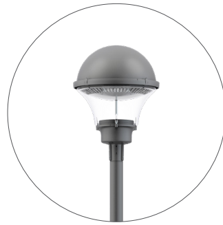
GO Dark grey