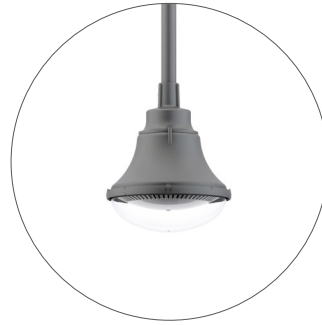
GO Dark grey