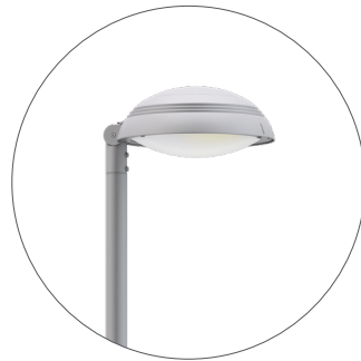
GC Light grey