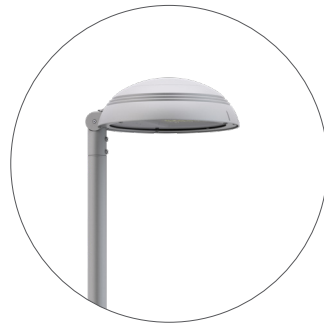
GC Light grey