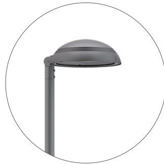
GO Dark grey