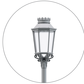
GC Light grey