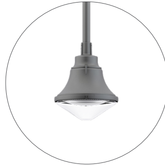
GO Dark grey