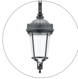
GO Dark grey