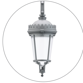
GC Light grey