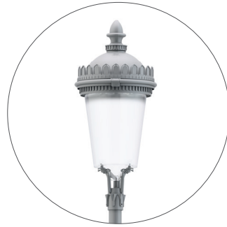
GC Light grey