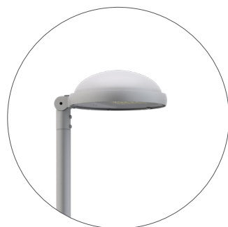
GC Light grey