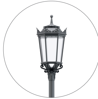
GO Dark grey