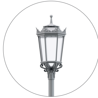
GC Light grey