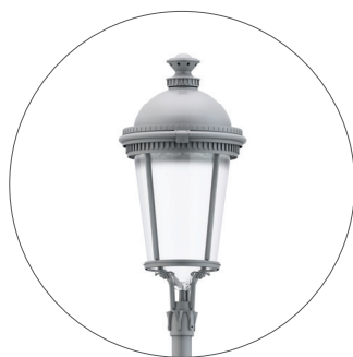
GC Light grey