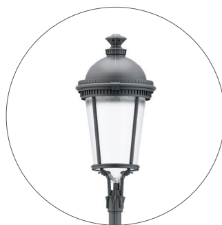
GO Dark grey