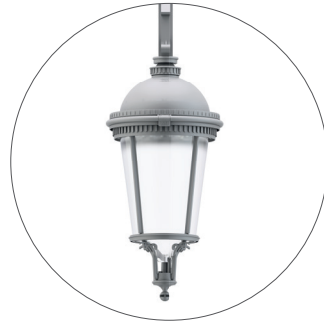
GC Light grey