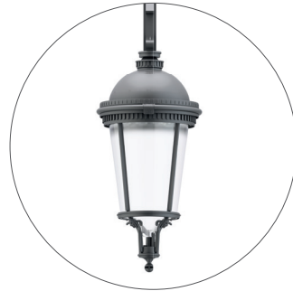
GO Dark grey