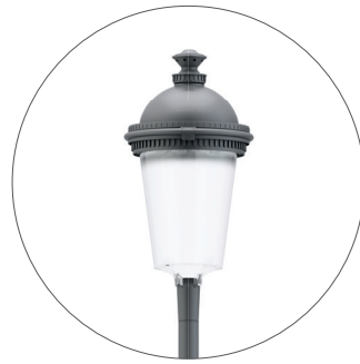
GO Dark grey