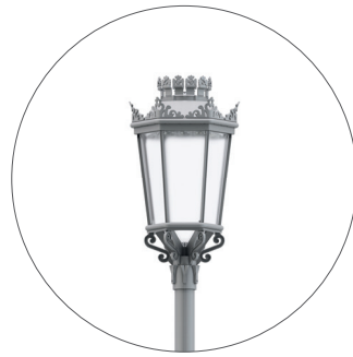
GC Light grey