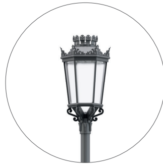
GO Dark grey