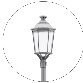
GC Light grey