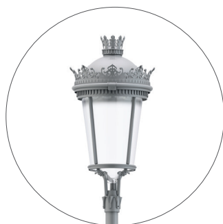
GC Light grey