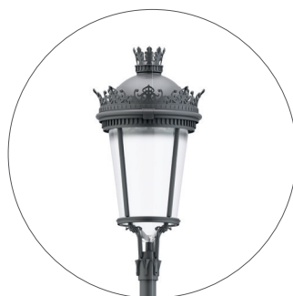
GO Dark grey