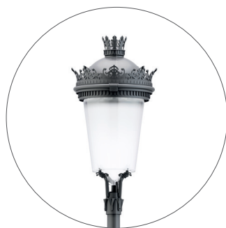
GO Dark grey