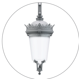
GC Light grey