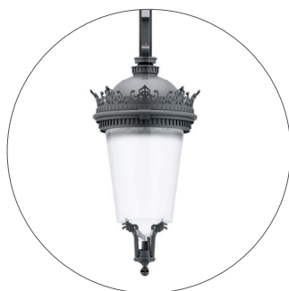
GO Dark grey