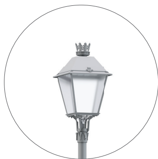
GC Light grey